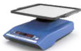
ROCKER 3D digital