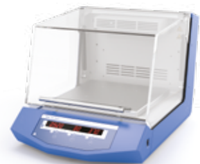
KS 3000 i control