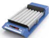
ROLLER 6 digital